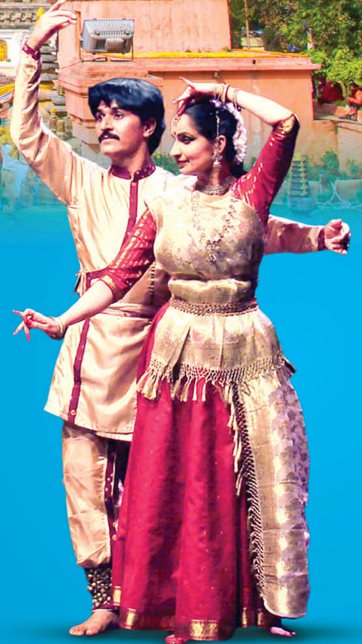
Bhojpuri Kathak dance