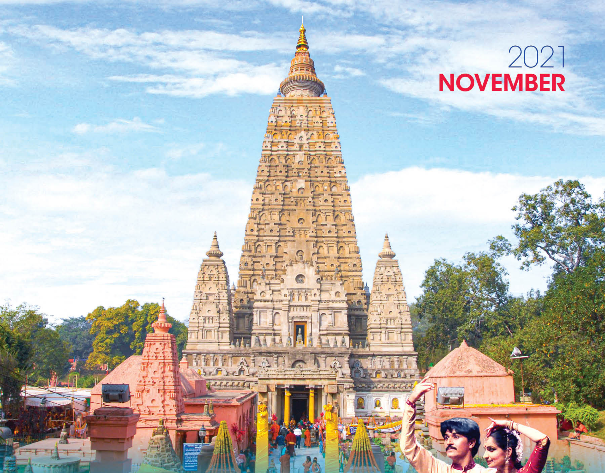
Mahabodhi Temple - Bodh Gaya, Bihar