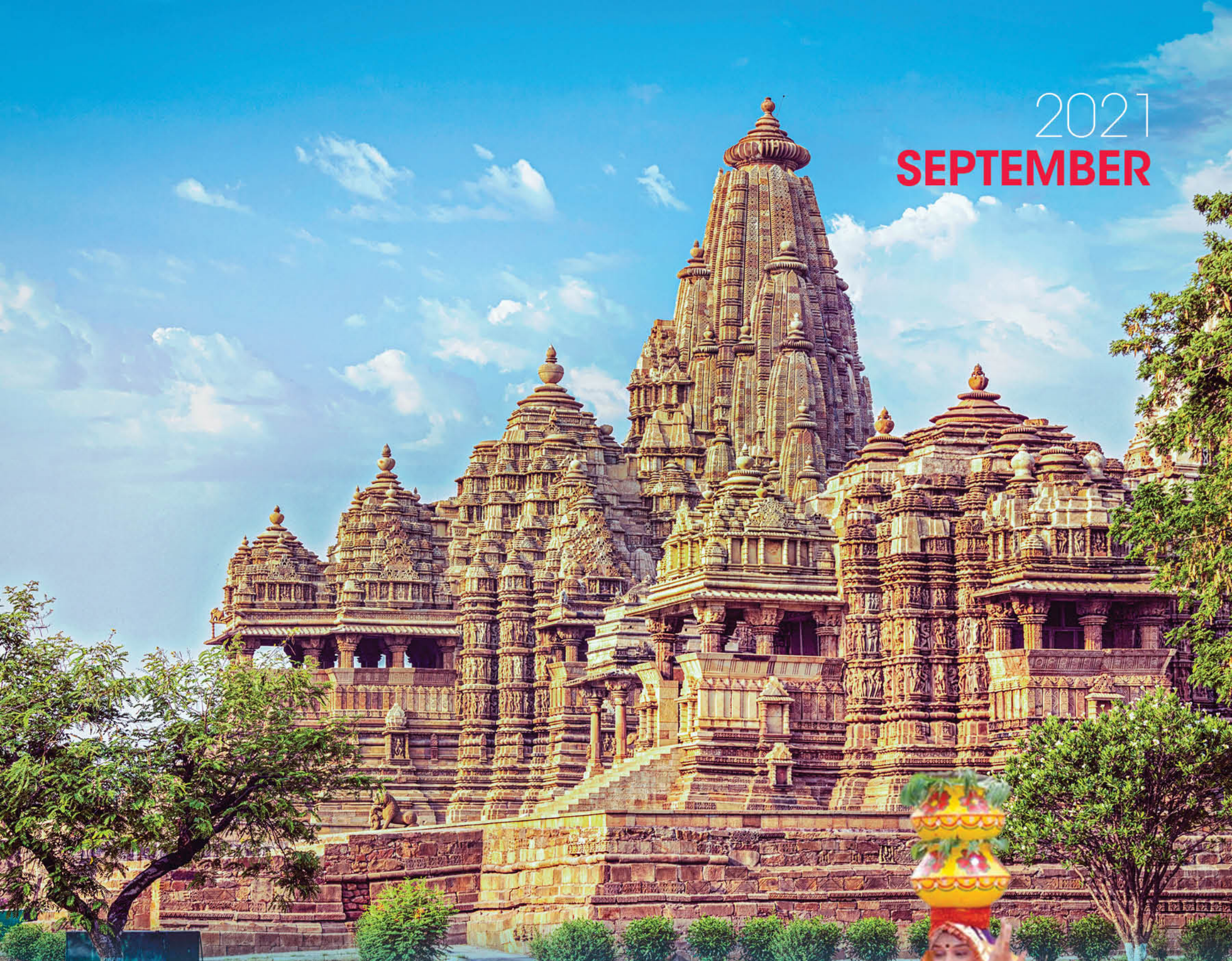
Khajuraho Temple - Chhatarpur, Madhya Pradesh