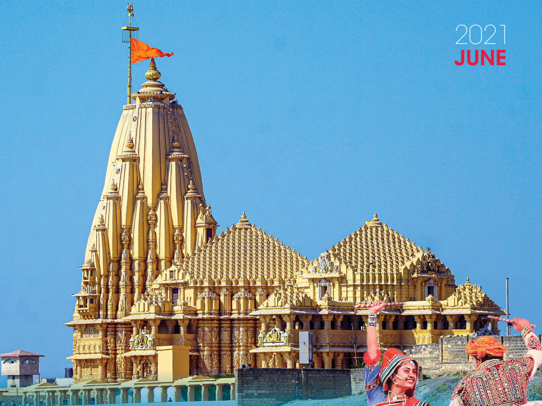
Somnath Temple - Veraval, Gujarat