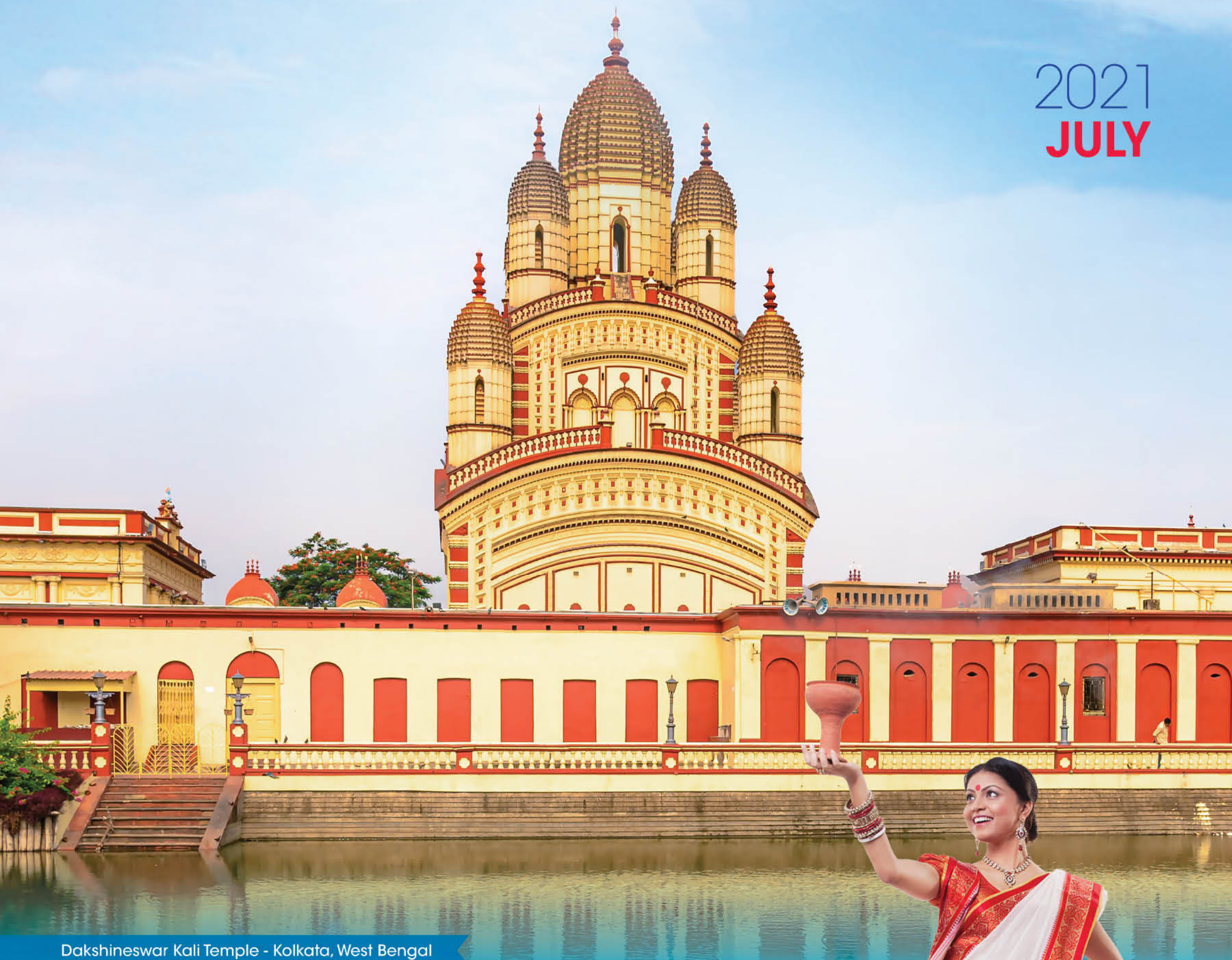
Dakshineswar Kali Temple - Kolkata, West Bengal