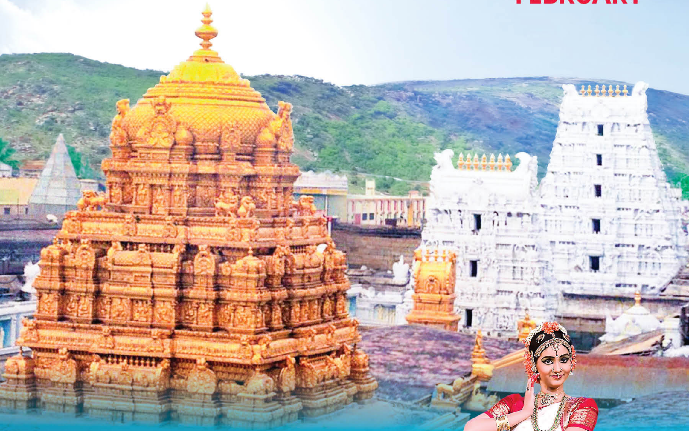
Tirumala Tirupati Temple - Tirupati , Andhra Pradesh