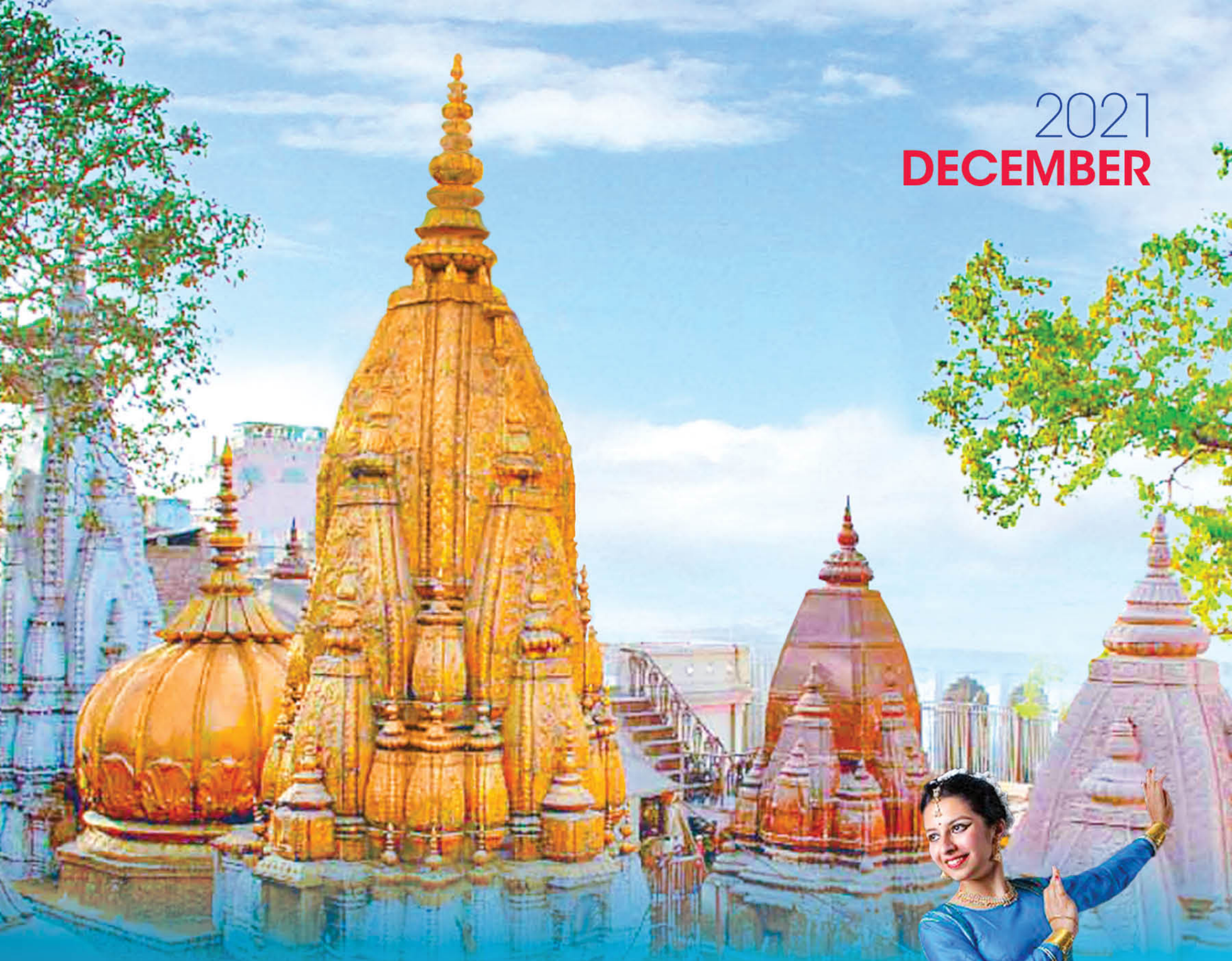
Kashi Vishwanath Temple - Varanasi, Uttar Pradesh