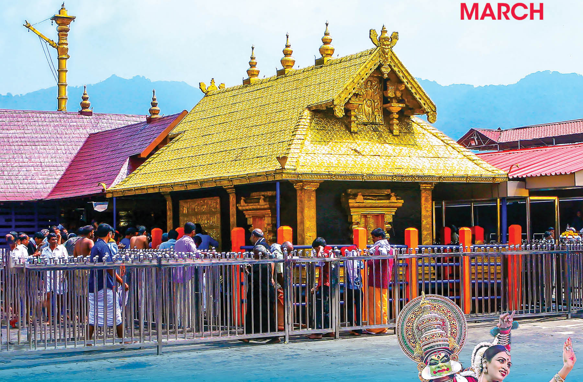
Sabarimala Temple - Perinad Village, Kerala