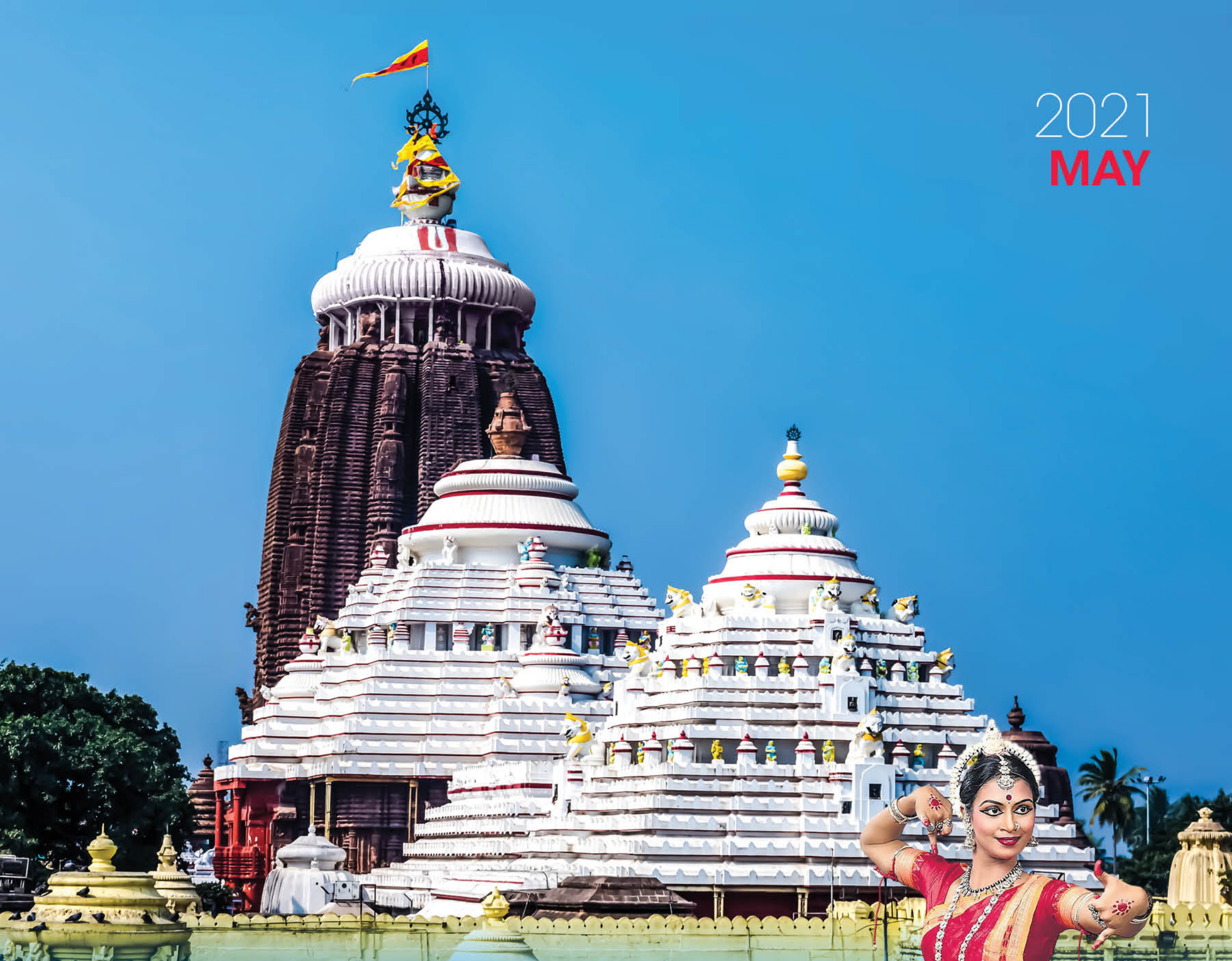
Jagannath Temple - Puri, Odisha