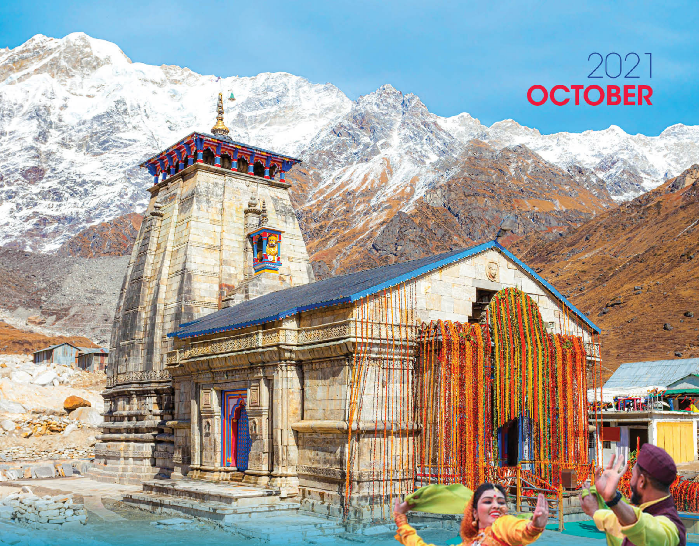
Kedarnath Temple - Kedarnath, Uttarakhand