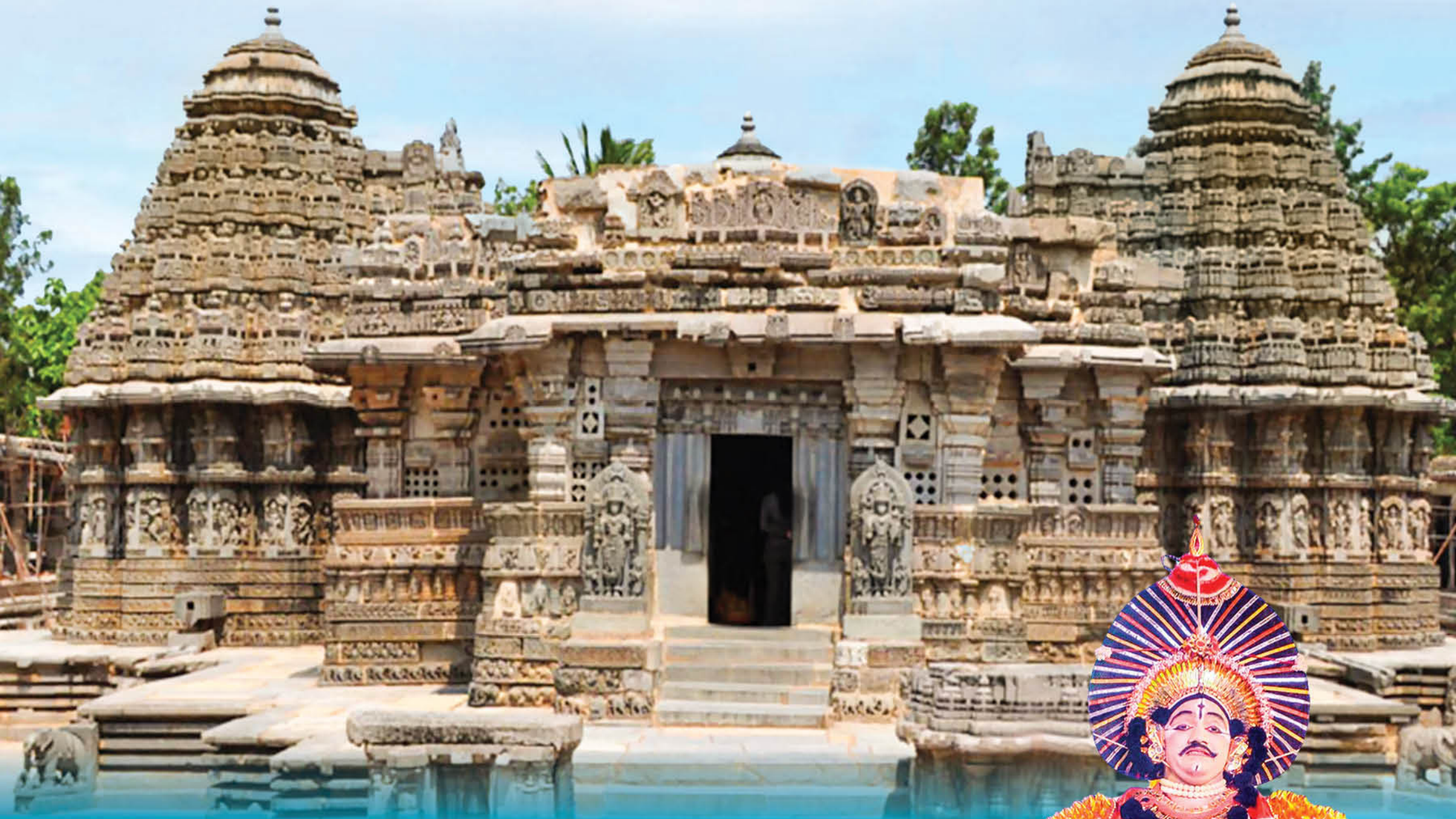
Hoysaleswara Temple - Halebidu, Karnataka