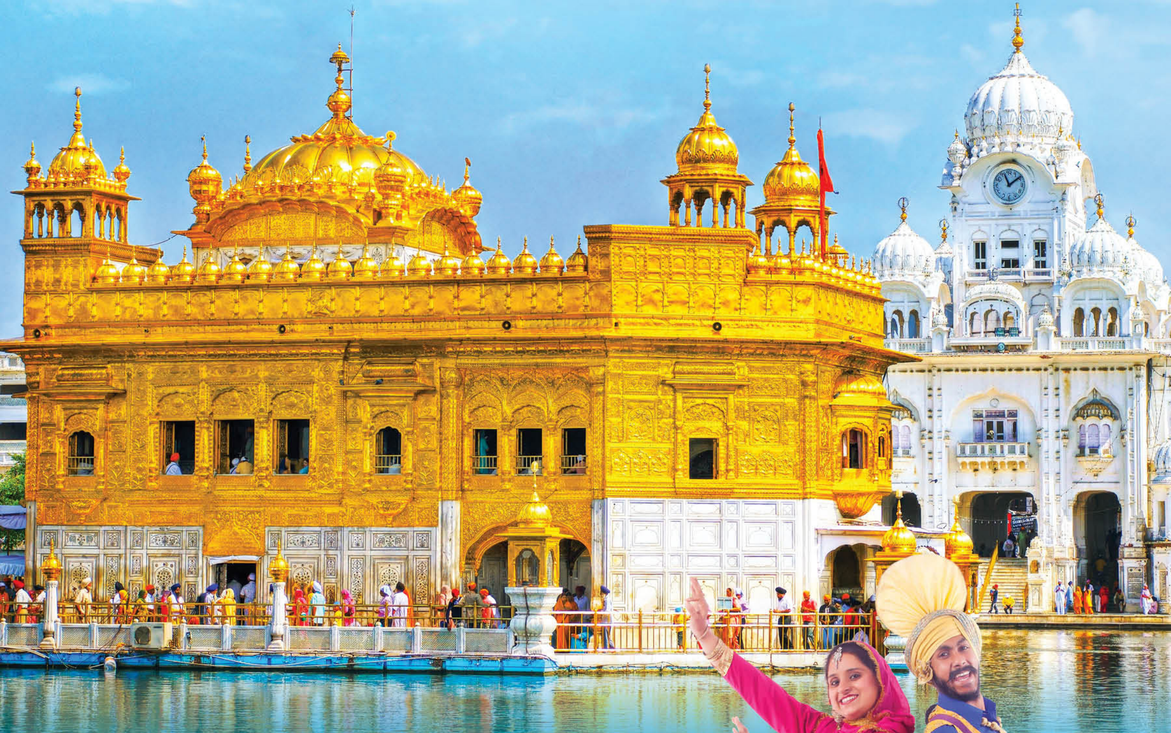
Golden Temple - Amritsar, Punjab