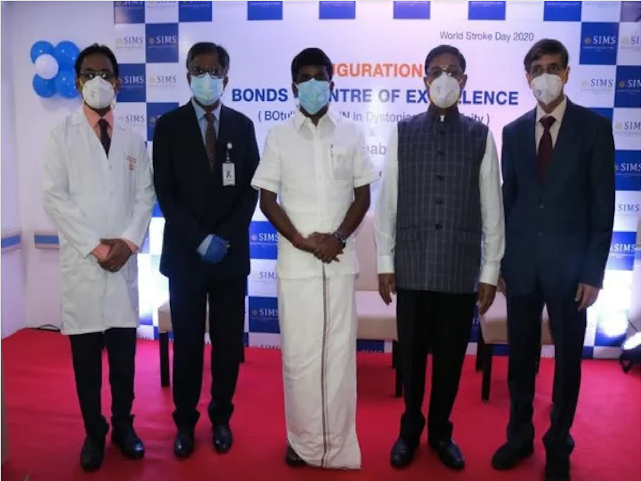
Dr C Vijaya Baskar, Minister for Health and Family Welfare, Govt. of Tamil Nadu Inaugurates 'BONDS' Centre of Excellence