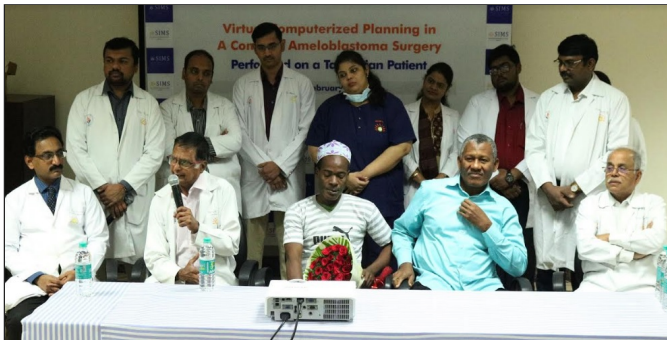
SIMS Hospital gives a new lease of life to a 38-year old Tanzanian affected by ameloblastoma

The Chennai based SIMS (SRM Institutes for Medical Science) Hospital, one of the leading super speciality quaternary care hospitals in Tamil Nadu, put an end to a thirty-eight year old Tanzanian patient's pain and misery of 14 years caused by a more than 1 kg weighing Ameloblastoma in the lower jaw. Lack of early medical intervention and diagnostic facility in his country, made it difficult for him to chew and eat his food, which in turn affected his overall quality of life significantly. With a defective and continuously increasing lump in the jawbone, the Tanzanian patient was referred to SIMS, Vadapalani, Chennai by his Government for a holistic treatment.