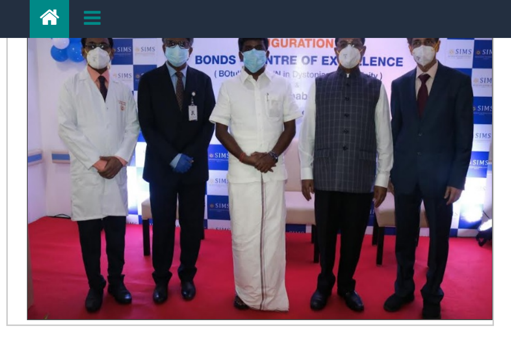
Dr. C Vijaya Baskar, Hon'ble Minister for Health & Family Welfare, Govt. of Tamil Nadu Inaugurates 'BONDS' Centre of Excellence, a first-of-its-kind center dedicated to Dystonia & Spasticity movement disorders at SIMS Hospital, Vadapalani on 29th Oct. 2020