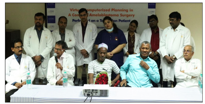
SIMS Hospital gives a new lease of life to a 38-year old Tanzanian affected by ameloblastoma

The Chennai based SIMS (SRM Institutes for Medical Science) Hospital, one of the leading super speciality quaternary care hospitals in Tamil Nadu, put an end to a thirty-eight year old Tanzanian patient's pain and misery of 14 years caused by a more than 1 kg weighing Ameloblastoma in the lower jaw. Lack of early medical intervention and diagnostic facility in his country, made it difficult for him to chew and eat his food, which in turn affected his overall quality of life significantly. With a defective and continuously increasing lump in the jawbone, the Tanzanian patient was referred to SIMS, Vadapalani, Chennai by his Government for a holistic treatment.