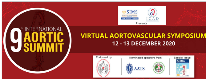
9th International Aortic Summit