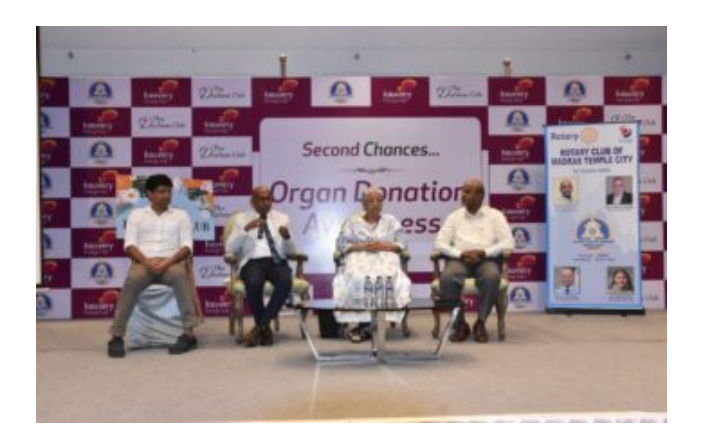
Members\ of\ The\ Duchess\ Club-\ all\ women\ club,\ take\ a\ pledge\ for\ Organ\ Donation